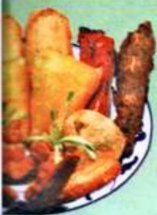
Pu Pu Platter