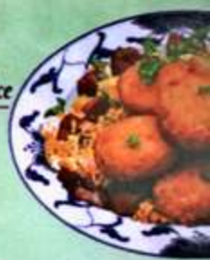
Fried Scallops w. Fried Rice

All Dishes Served w. Pork Fried Rice or White Rice