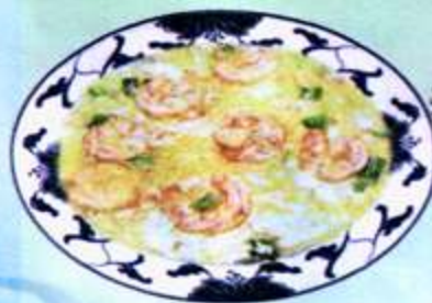
Shrimp w. Broccoli