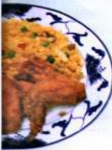
Chicken Wings w. Fried Rice