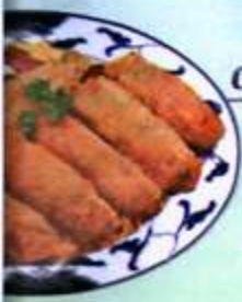
Crab Stick w. Fried Rice