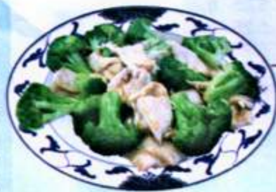
Chicken w. Broccoli