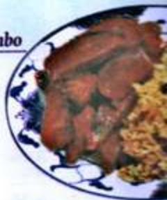
Boneless Spare Ribs Combo