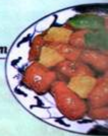
Sweet & Sour Chicken